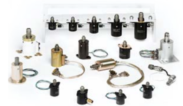
TiNi™ Ejector Release Mechanisms (ERM) Family of products

ENSIGN-BICKFORD AEROSPACE & DEFENSE COMPANY 640 HOPMEADOW STREET, P.O. BOX 429, SIMSBURY, CT 06070, USA www.EBAD.com